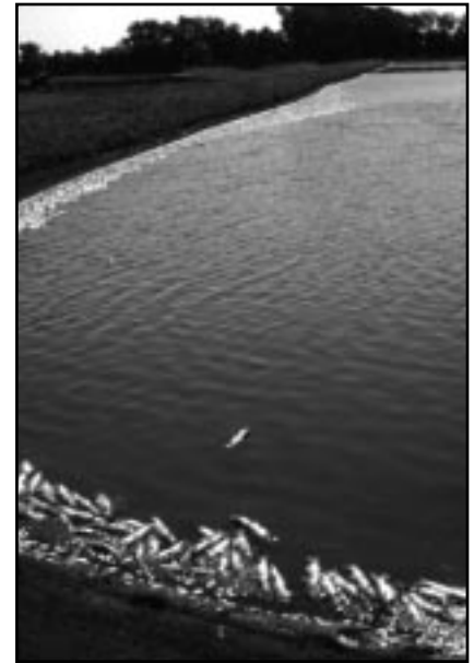
Figure 1. The price of poor water quality management is dead or sick fish.

As you make plans, you will find it to your advantage to ask some hard questions. Find out if your ideas make good technical and economic sense by talking with a wide range of people. This includes potential customers, Extension specialists, Natural Resources Conservation Service professionals, businessmen and others. Visit as many fish farms as you can. Keep an open mind but remember that some fish farmers have pet theories and ideas that may or may not apply to your situation.