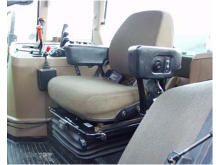
Figure 4.6.6.e. Locate seat adjustments and know how they work. You may need the Operator's Manual. Farm and Ranch Safety Management , John Deere Publishing, 1994. Illustrations reproduced by permission. All rights reserved.

Seat belts keep tractor drivers from being thrown out of the cab or off the seat during roll-overs.