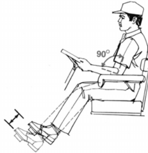
Figure 4.6.6.f. The steering wheel should be adjusted as soon as you are seated. In the correct position, your arms are bent at a 90-degree angle as you hold the steering wheel. Your legs should remain slightly angled while the foot pedals are fully depressed.