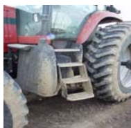
Figure 4.6.6.b. Falls account for many farm injuries. Keep the steps and platform clean of mud, manure, and tools.