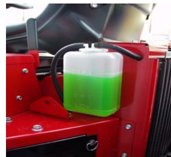
Fig. 4.6.1.d. Check the coolant level with the engine cold.