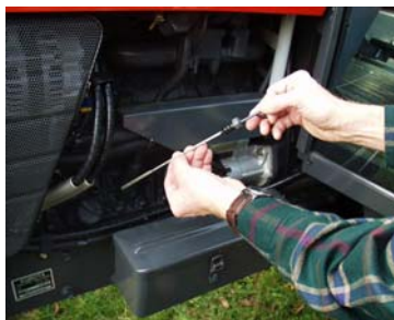
Fig. 4.6.1.c. Check the oil level.