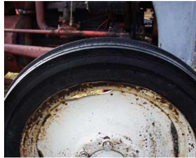
Fig. 4.6.5.c. Damaged rims from careless use may cause damaged tire beads and flat tires.