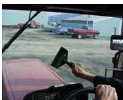
Figure 4.6.6.d. Keep windows and mirrors clean for good visibility.

The tractor platform serves as the cockpit of this farm tool.