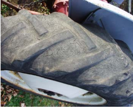
Fig. 4.6.5.b. Worn treads and dry rot make for poor traction and risk for downtime due to a blowout.