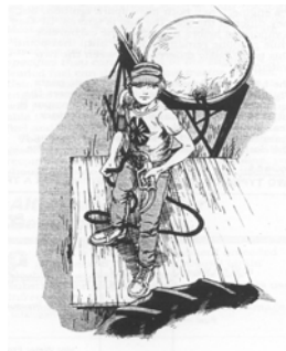
Figure 4.6.1.a. Before driving the tractor to the field, check for the possibility of an empty fuel tank. If you run out of fuel during a workday, you are causing downtime losses.

before you touch the tractor ignition switch. Developing this habit will help you to understand that the tractor engine is ready for field work.