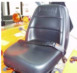
Figure 4.6.6.c. Tractors with ROPS come equipped with seat belts. Use them.