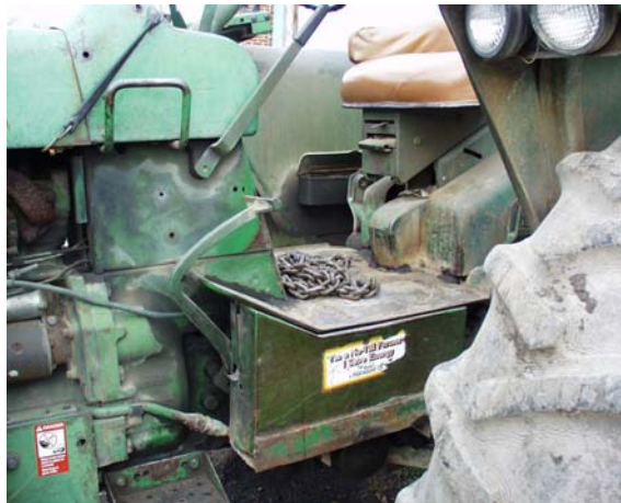
Figure 4.6.6.a. The operator's platform is not a tool box. You must have room to operate hand and foot controls. PTO levers, differential locks, foot throttles, and brake locks have to be engaged from the floor position. Soda cans and tobacco snuff containers can roll under control pedals and prevent correct, timely operation.

This task sheet discusses the need for a clear tractor operator platform and an adjustable seat to safely reach the operating controls.