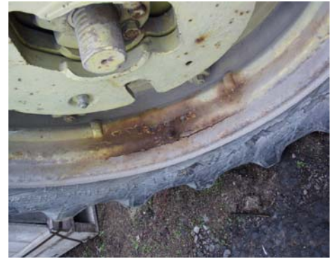
Fig. 4.6.5.d. A leaking valve stem released calcium solution which rusted the rim. A major expense will be incurred, as well as a severe safety hazard in using this tractor.

Tractor tires are expensive. They may cost hundreds of dollars to repair or replace.