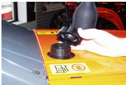
Fig. 4.6.1.b. Check the fuel level.