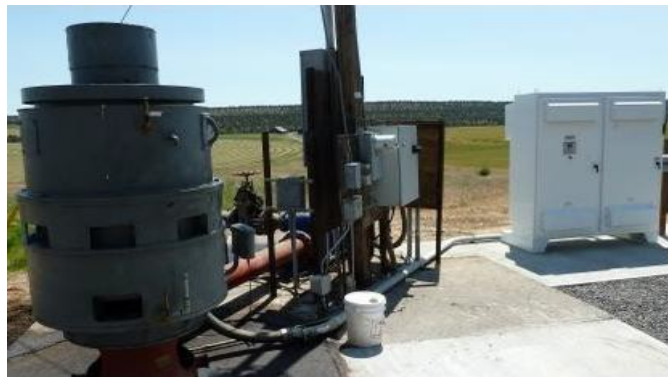
Variable Frequency Drive-Controlled Irrigation Pump