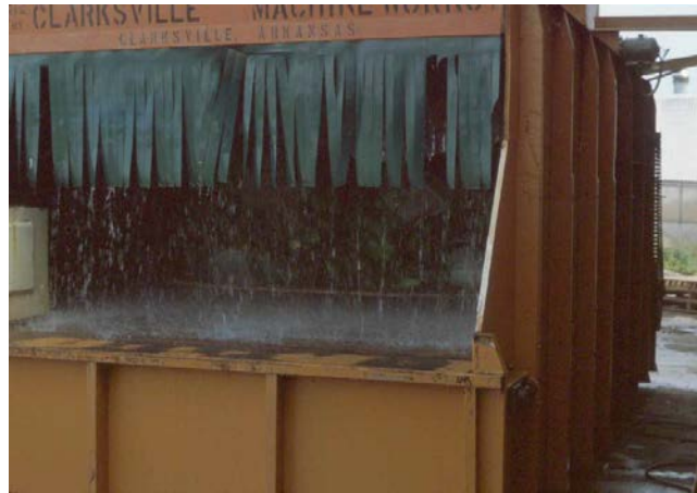
Hydro-Cooler with Air Exclusion Flaps

tunnel should be stacked to avoid open air gaps. The tarps used to cover the boxes should also be free of holes and in close contact with the boxes.