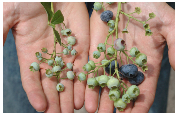
Pollination is essential for blueberry production. On the left , a blueberry cluster that was enclosed in a mesh bag during bloom to exclude pollinators. On the right , a blueberry cluster that received pollination.

Cool, rainy, and windy spring weather can lead to poor pollination. When multiple pollinator species are active, more flowers are likely to be visited on poor weather days. Large-bodied bees, such as bumble bees and carpenter bees, stay more active under cool and cloudy conditions than honey bees and can help pollinate the crop in variable spring weather.